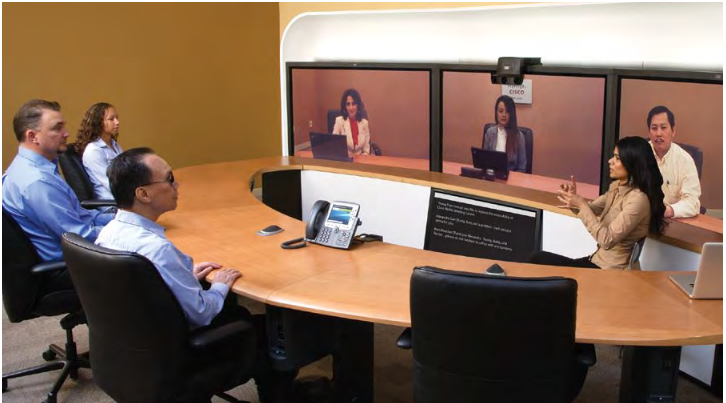
The Cisco TelePresence® portfolio creates an immersive, face-to-face experience over the network.