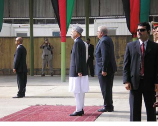
President Karzai attending the ribbon cutting ceremony of the National Military Command Center- completed by DasNet (shown below) in Afghanistan.

On other projects, DasNet provided a two-story flat pack office building with installation to include concrete pads for trailer foundations, offloading trailers with a crane, assembling units, installing stairs, and electrical hook-ups. We have provided management, tools, equipment, transportation, supervision and labor necessary to restore a US Forward Operating Base project site. This project consist of demolishing and removing concrete pads, wet RLB units, underground septic tank, fencing, concrete barriers, tent shelters, supporting infrastructure, site grading and all associated site preparation. Additionally, we are involved with projects ranging from helicopter landing pads to dormitory buildings.